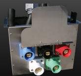
Power Outlet Box