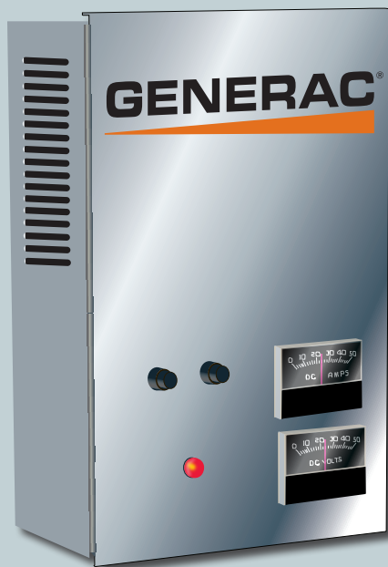
Diagram 2 - Typical Auto Battery Charger